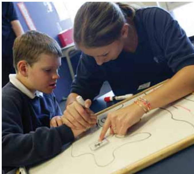
A pupil during a handwriting session at Priors Court school, which provides specialised education for children with autism and was established by founding patron Dame Stephanie Shirley.

“I believe that philanthropy needs to be proactive, ambitious and focused on results”