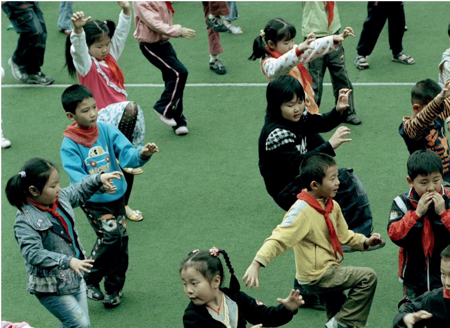
Broadening educational opportunity is a clear priority among philanthropists in this study.

Several individuals mentioned their support of Hope Schools, an initiative of Project Hope – established by the China Youth Development Foundation (CYDF) in 1989 – with a mission of bringing education to the poorest parts of China. It has been described as one of the most extensive, influential and widely utilized philanthropic programs in China. Project Hope builds schools in rural areas, called Hope Primary Schools, with the vision of improving the education infrastructure. The program encourages private support from corporations and individuals; a donation of RMB 500,000 (about USD 72,000) builds one school. As of 2013, Project Hope had raised RMB 9.757 billion (USD 1.4 billion), aided over 4.9 million financially-challenged rural students, and built 18,335 Hope primary schools. 33 Shum Chiu Hung has sponsored 13 Hope Schools, and Zong Qinghou and Li Jinyuan both mentioned their support for Project Hope.