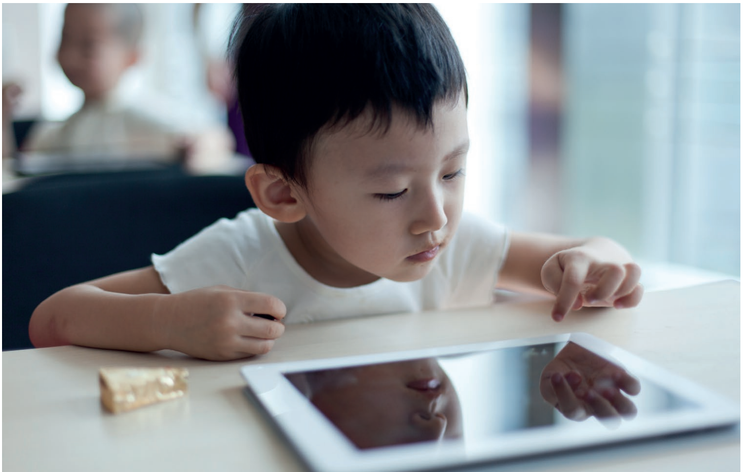
China is home to the world's largest number of Internet users. In the philanthropic sector, technology is being used to advance programmatic goals and encourage and facilitate giving.