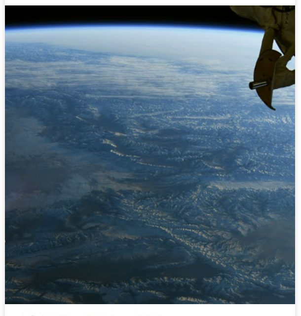
NASA and Intl. Space Station 8:34 PM · Dec 3, 2019 · Twitter Web App

Grateful to have such an incredible world to give to this #GivingTuesday .