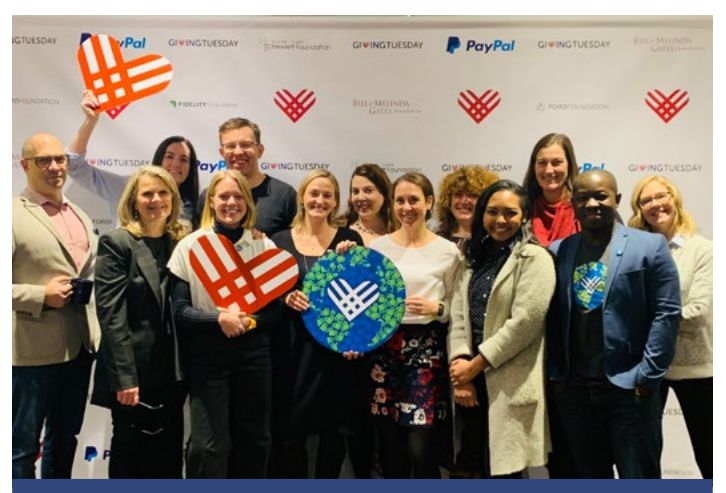
The GivingTuesday core team, which serves as a backbone to the movement, celebrating at HQ on 12/3.

In the world of philanthropy, there is growing tension and chafing at the same old models, outdated best practices, and long-held paradigms. At GivingTuesday, we see the generosity landscape as rich in possibility, complexity and diversity. Around the world, our leaders promote solidarity, kindness, unity, and power among their communities. Our global network shares a unified vision for a more generous world, but each country and community is unique. We celebrate the knowledge that is only borne of lived experience among leaders working to address inequality and social justice.