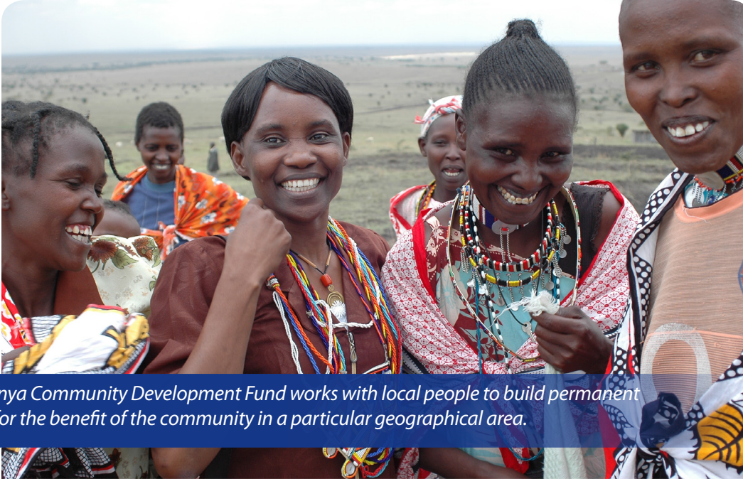
The Kenya Community Development Fund works with local people to build permanent funds for the benefit of the community in a particular geographical area.

A particularly important task is to build on various indicator sets developed by the Knight Foundation 10 and the Global Fund for Community Foundations. 11 Once this is done, it would be useful to publish studies that demonstrate the added value of community philanthropy to the field. These should focus on what is different about outcomes when community philanthropy is present compared with when it is not. As we saw with the Tewa example earlier on, it is empirical evidence that provides proof of concept.