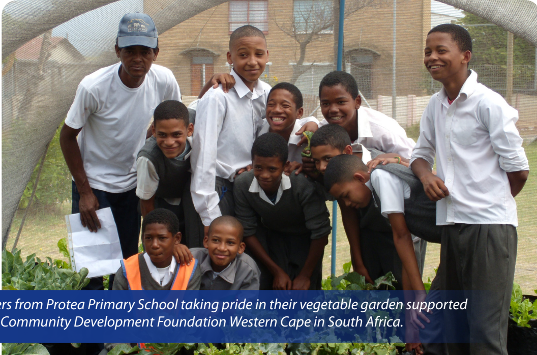
Learners from Protea Primary School taking pride in their vegetable garden supported by the Community Development Foundation Western Cape in South Africa.

leadership," "social capital," "sustainability," and "reduction of dependency." 5 Such factors are regarded as important yet are hard to measure. In the meetings in Washington and Johannesburg, participants accepted without question that these factors were good and valuable outcomes from community philanthropy.