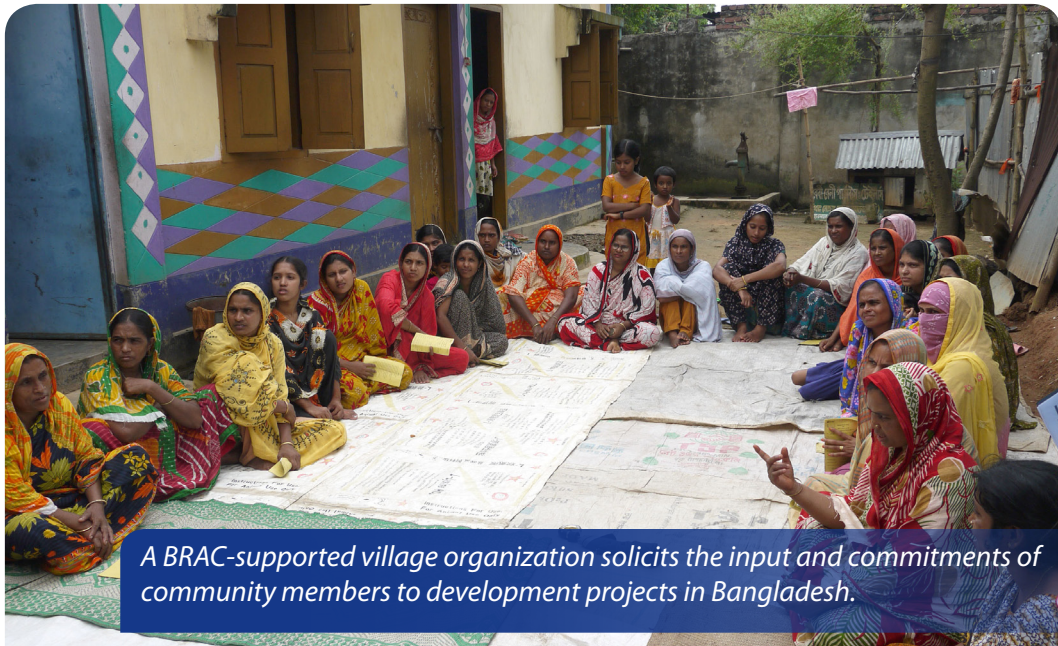
A BRAC-supported village organization solicits the input and commitments of community members to development projects in Bangladesh.

3. Partnership: to join top-down efforts with the views of beneficiaries of programs so that there are complementarities between different interests, particularly by developing horizontal relationships between community organizations to bring the voice of local people to the development table.