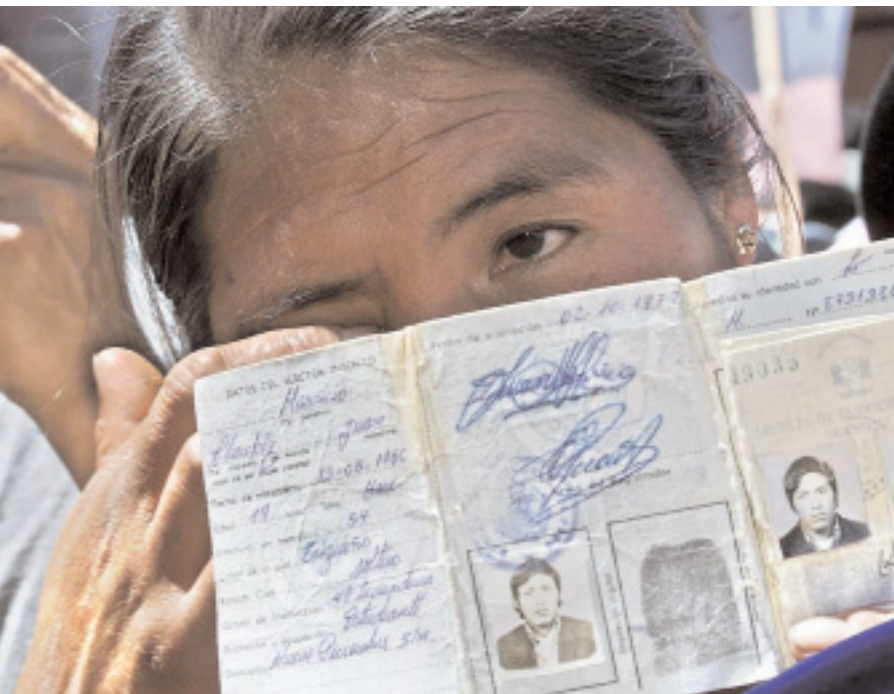
A Peruvian widow seeks answers from the country's Truth and Reconciliation Commission.