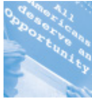
Photo: Students at the Massachusetts Institute of Technology express support for affirmative action in higher education at a rally in March 2003.

Finally, we support efforts to secure and fulfill the human rights of particularly vulnerable individuals and groups. In the United States, for example, the Arab Community Center for Economic and Social Services is helping 10 grass-roots organizations improve their services and advocacy for Arab-American communities where residents may face being stopped, questioned, detained, or harassed in connection with new security efforts. Grantees in Brazil, China, India, Indonesia, and other countries are working to curb gender violence—both in the home and in the larger society—by changing laws, attitudes, and behavior. The University of Michigan, the NAACP Legal Defense and Educational Fund, the Mexican American Legal Defense and Educational Fund, and other grantees helped win a landmark case before the U.S. Supreme Court, which upheld affirmative action to promote diversity and academic excellence.