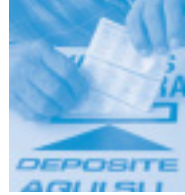
Photo: A Mexican man exercises his right to vote in the eastern state of Puebla in July 2003.

Moreover, we make grants to organizations working to strengthen the capacity and responsiveness of local governments. In particular, we support efforts that emphasize citizen participation. For example, the International Budget Project assists organizations in nearly 40 countries that are pressing for more open and transparent negotiations about government budgets. The project also works to build the capacity of citizens' groups to engage in dialogue about priorities.