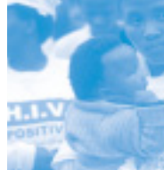
Photo: Marchers outside South Africa's High Court on December 14, 2001, when it ruled that the government must help pregnant women with HIV protect their newborns from AIDS.

religion, and identity. For example, we support efforts to erase the stigma and discrimination associated with H.I.V./AIDS. Recent grants in Vietnam are supporting workshops for journalists, business leaders, and health officials, who are all in a position to shape public perceptions about the disease. In the United States, the National Association of People Living with H.I.V./AIDS is working to overcome the divisive forces of racism, sexism, and homophobia, which often hamper communities combating the epidemic.