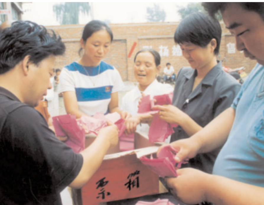
Electoral workers count votes in Qianxi County, part of China's Hebei Province, in July 2003.