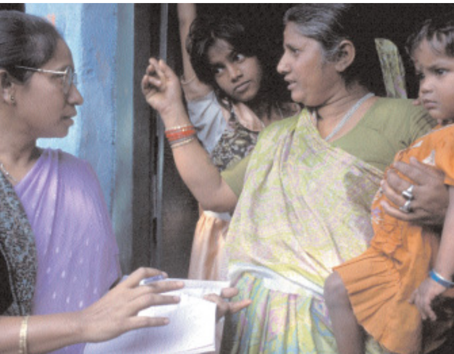
Family-planning workers collect information about slum dwellers in Calcutta, India.