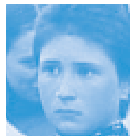
Photo: Students hold a candlelight vigil in Moscow's Red Square in July 2001 as part of a grass-roots campaign against importing nuclear waste into the Russian Federation.

We also make grants to promote and protect democratic “public spheres”—at both the national and the global level—that encourage debate on key policy issues and enable citizen oversight of public and private power. In the United States, the Center for Public Integrity and OMBWatch are bringing to light conflicts of interest and promoting accountability in the public sector. In Bangalore, India, the Public Affairs Center has been conducting an independent survey of public services to strengthen civil society demands for improved accountability and performance. We also support new media ventures like opendemocracy.net , a Web site that reflects varied perspectives on globalization, culture, migration, and other pressing social issues.