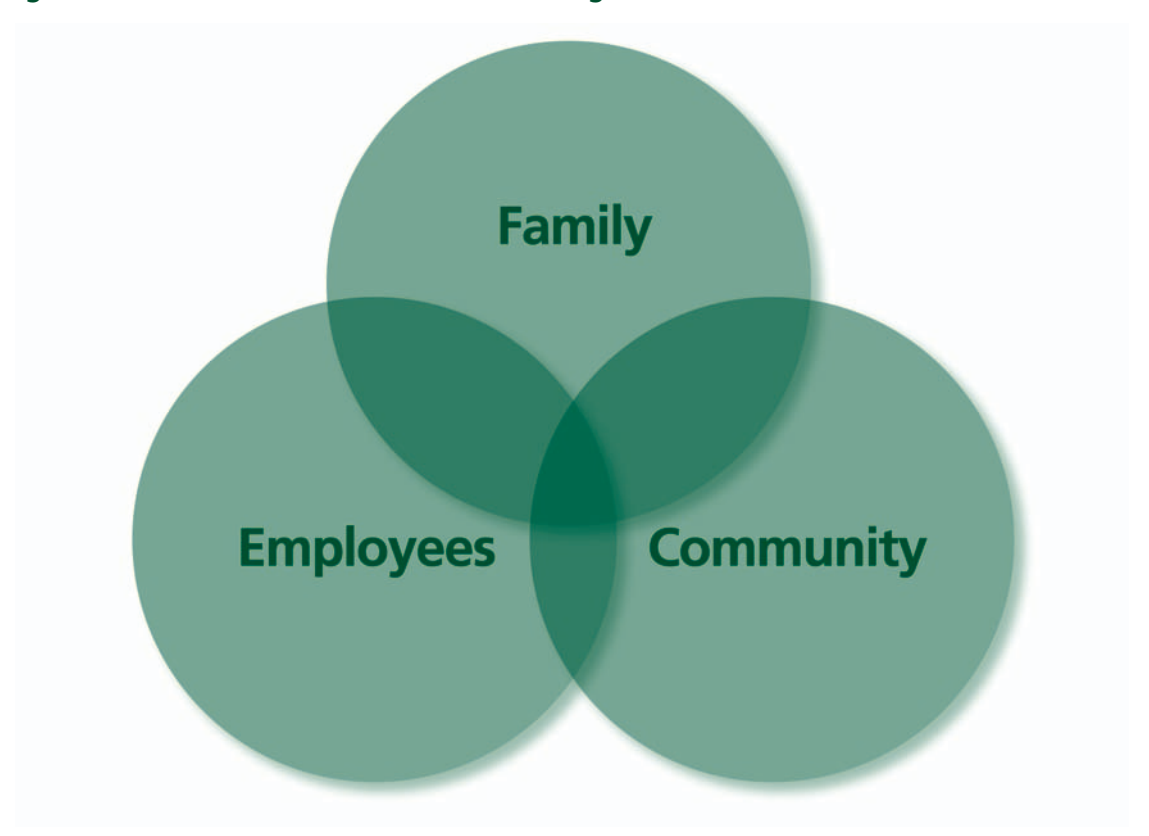
Overlapping stakeholders in family business philanthropy and social responsibility

"In a family business it's the overlapping circles that actually drive the business, and it's the same for philanthropy and social responsibility – it's a bit of altruism, a bit of values, a bit of ego and a bit of what the others are doing."