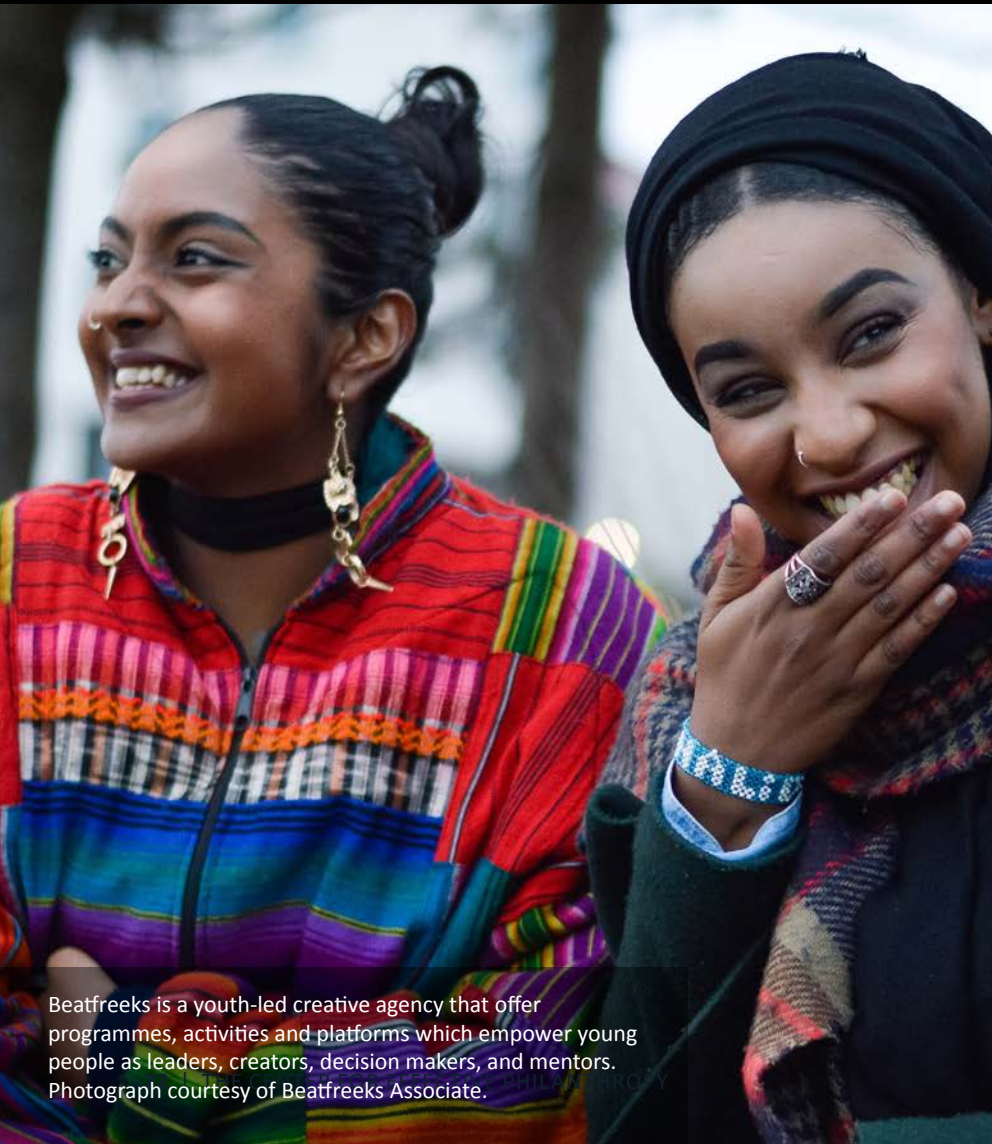
Beatfrees is a youth-led creative agency that offer programmes, activities and platforms which empower young people as leaders, creators, decision makers, and mentors.