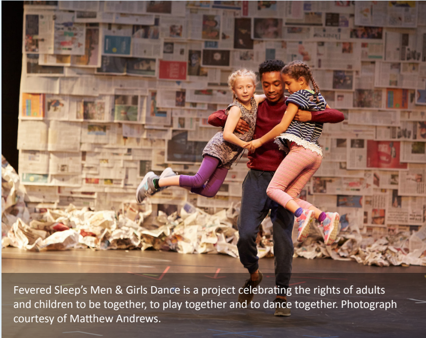
Fevered Sleep's Men & Girls Dance is a project celebrating the rights of adults and children to be together, to play together and to dance together.