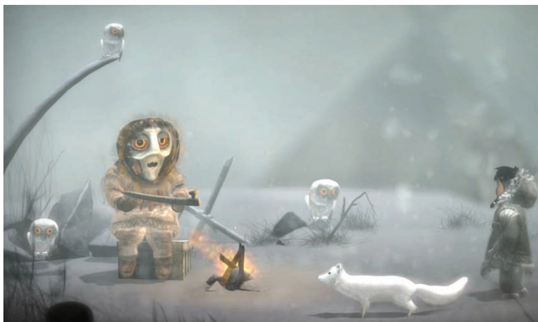
Screenshot from the video game Owlman, a Cook Inlet Tribal Council initiative.

Rasmuson Foundation also uses impact investing as part of its programs. One example was a $1 million program-related investment (PRI) in the Cook Inlet Tribal Council’s (CITC) video game initiative. Rasmuson Foundation, the largest private foundation in Alaska, had maintained a traditional philanthropic relationship with the Native organization for nearly two decades, funding such initiatives as capital support for CITC’s service centers. “Through this PRI the foundation saw the potential power of video games as a way not only to create a revenue stream to sustain CITC’s mission, but also to