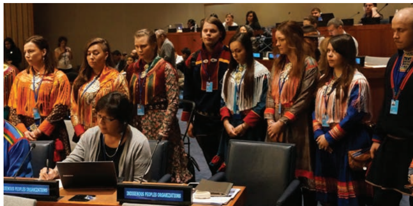
Indigenous Youth Caucus at the 2015 UN Permanent Forum on Indigenous Issues.

Those who support indigenous peoples find them invaluable partners in achieving their program goals. Environmental funders recognize that indigenous peoples live on the earth's last remaining reserves of high biodiversity. These funders, and those interested in cultural and language revitalization, support projects in indigenous communities. Others with a specific geographic focus often support indigenous partners when they comprise a majority of the population. Those who support social movements will fund organizing around indigenous rights and indigenous women, along with their participation in policymaking. In this publication, we will highlight some opportunities that indigenous peoples offer as partners with funders.