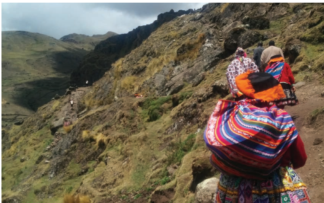
Quechua woman, member of the Association of the Communities of the Potato Park, leads the path high up in the Andes Mountains of Peru.