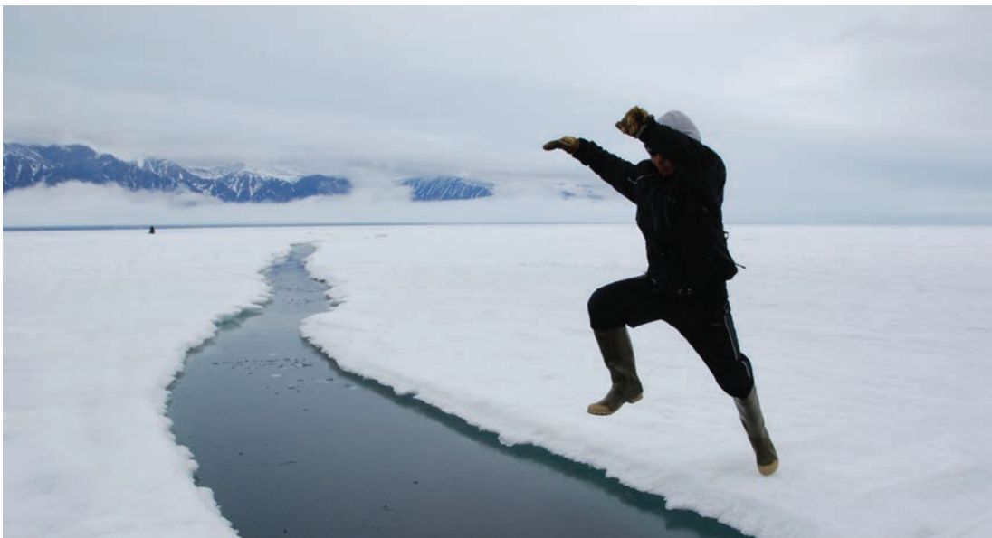
Inuk from Mittimatalik (Pond Inlet, Nunavut, Canada) jumps over lead in the sea ice en-route to the rich hunting grounds on the floe edge. Travel is increasingly dangerous and unpredictable as sea ice seasons grow shorter and New Year round shipping make conditions even more unstable. Photo by Anne Henshaw June 2015.

Some funders support indigenous peoples' travel to global meetings, such as sessions of the UN Permanent Forum on Indigenous Issues, or regional networking events, like the