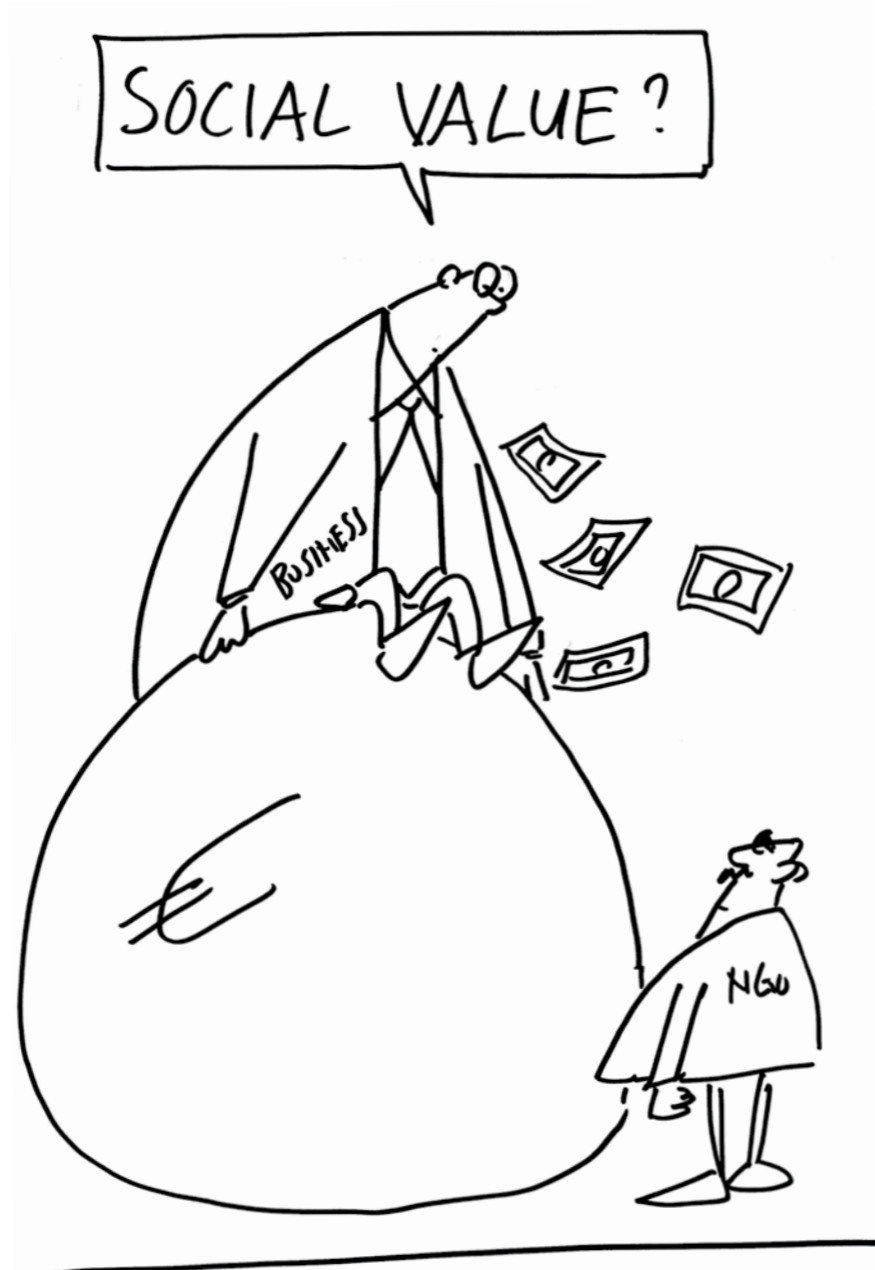
SPEAKING THE SAME LANGUAGE

any verifiable benchmarks that can say something about a situation before and after your intervention. This is and remains complex stuff, even more so when changing contexts make it very hard to tell whether the outcome/impact is due to any particular intervention, or indeed the joint intervention of a partnership. In short, any measured impact can be due to a whole range of other reasons: a change for the better in government, for instance, a sudden influx of money, or the (positive) influence that you might have enjoyed by a recently started development programme... However, this is not to say that one should abandon any attempt to monitor the results of the partnership. The Partnerships Resource Centre is currently working on a framework for monitoring and evaluating cross sector partnerships, which you can find on their website. An core element of this framework is the so-called 'impact value chain' which helps you to link the issue that you want to address, the efficiency with which you are addressing it and the ultimate impact (effectiveness) you can achieve. Ask yourself: could we have achieved the same impact without the partnership? PrC, 2012